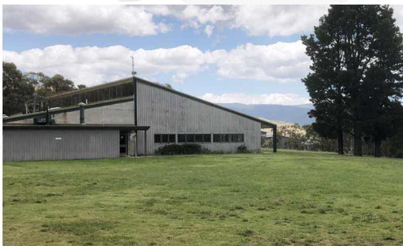
The Tony Balthasar Lodge