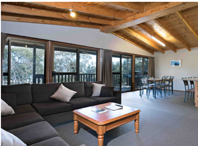
Dining and lounge room