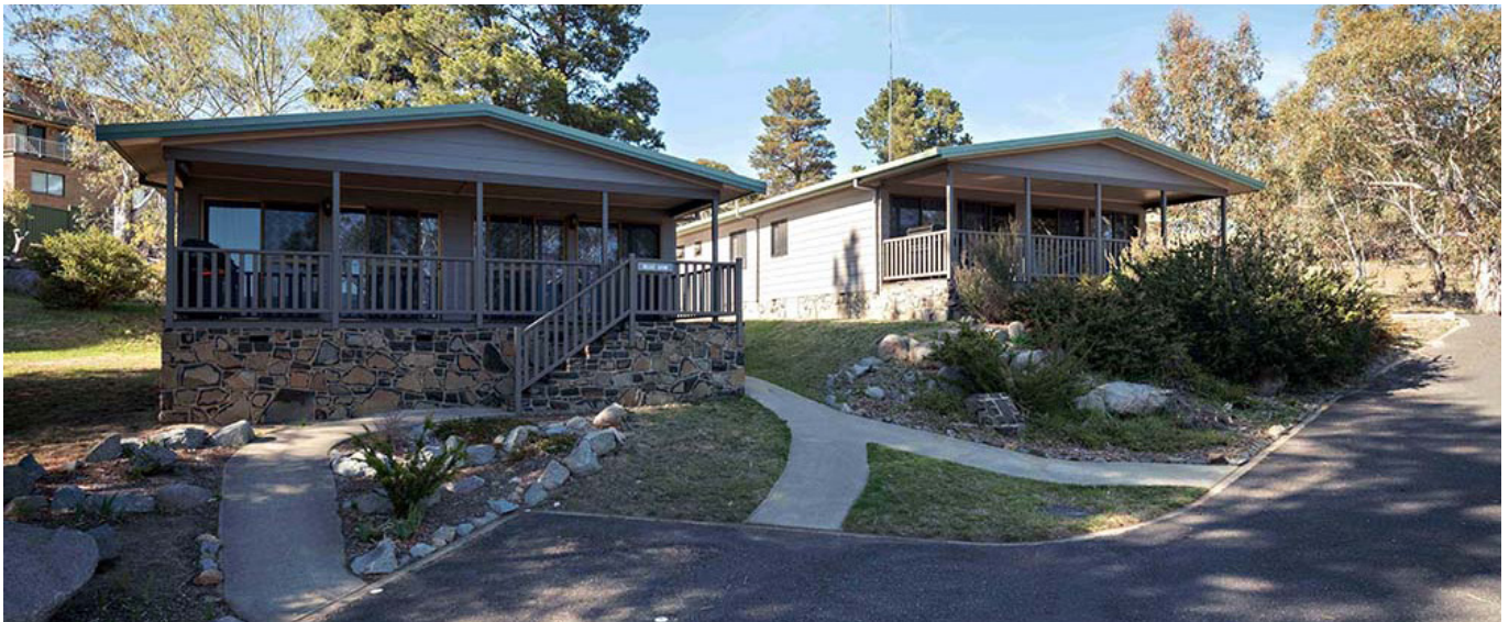
Blue Gum and Kanangra Cottages

Sleeps 8 over 3 rooms. 1 king, 1 double and 2 bunks. Open plan kitchen/dining/lounge, mud room with drying room attached, washing machine/dryer, 2 bathrooms with a separate toilet, heating and air conditioning, dishwasher and a BBQ on the veranda. The cottage is wheelchair accessible.