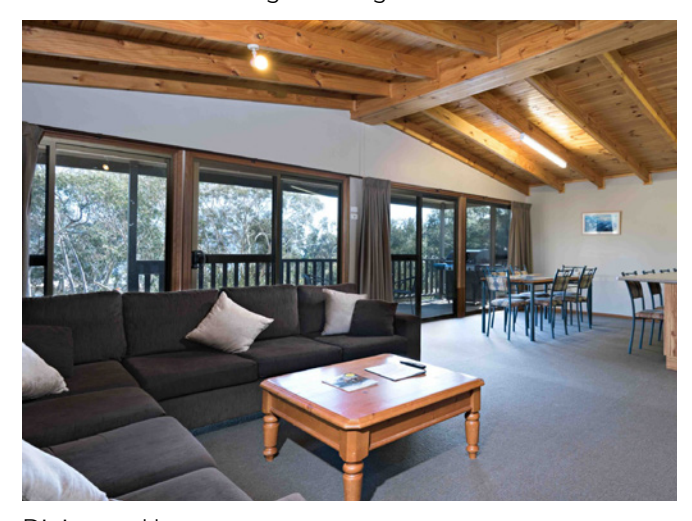
Dining and lounge room