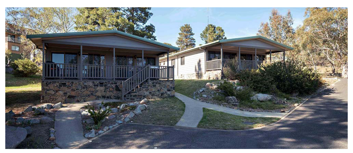
Blue Gum and Kanangra Cottages

Sleeps 8 over 3 rooms. 1 king, 1 double and 2 bunks. Open plan kitchen/dining/lounge, mud room with drying room attached, washing machine/dryer, 2 bathrooms with a separate toilet, heating and air conditioning, dishwasher and a BBQ on the veranda. The cottage is wheelchair accessible.